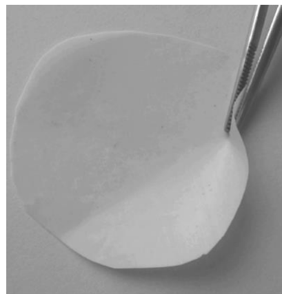
Figure 2. Typical PEO-based, HPA-added, nanocomposite membrane (Armand et al, 2011)

Based on extensive research in the field, Altech believes that 4N HPA will continue to be a key ingredient of future commercialised solid state lithium-ion battery. The demand for 4N HPA will likely increase further with the future development of solid state lithium-ion battery technology.